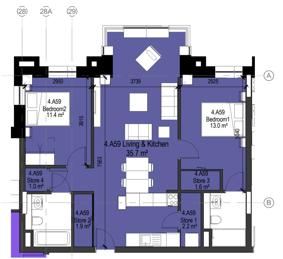
6 2 Bed Type 2.4J 1 : 100