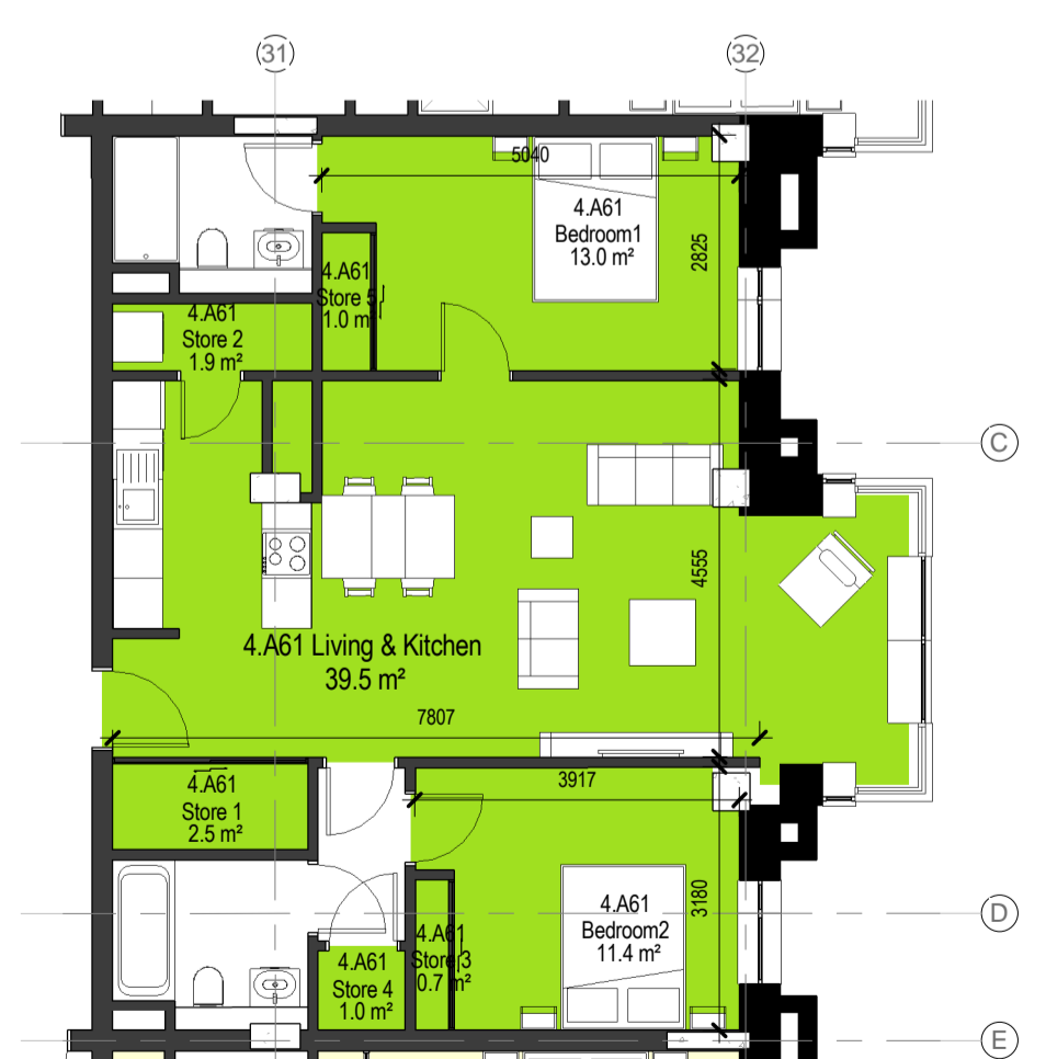
9 2 Bed Type 2.4M 1 : 100