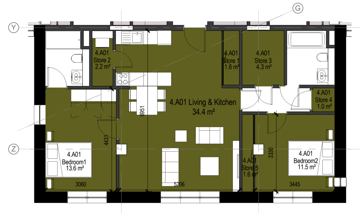
11 2 Bed Type 2.4O 1 : 100