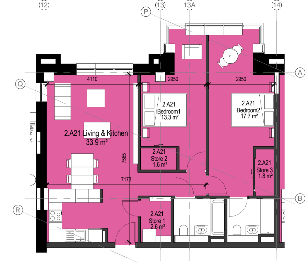
4 2 Bed Type 2.4H 1 : 100