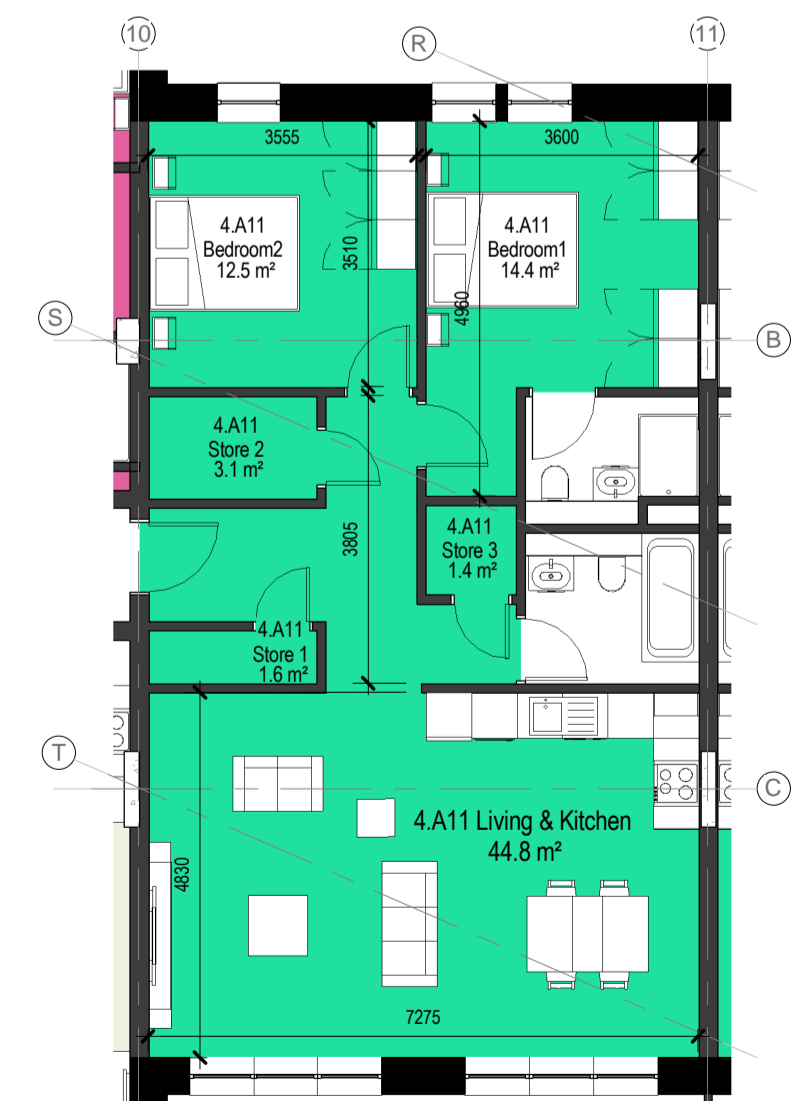
10 2 Bed Type 2.4N 1 : 100