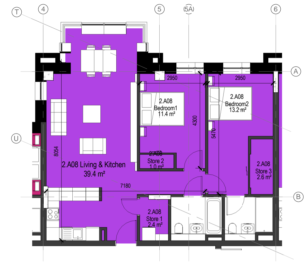
2 2 Bed Type 2.4G 1 : 100