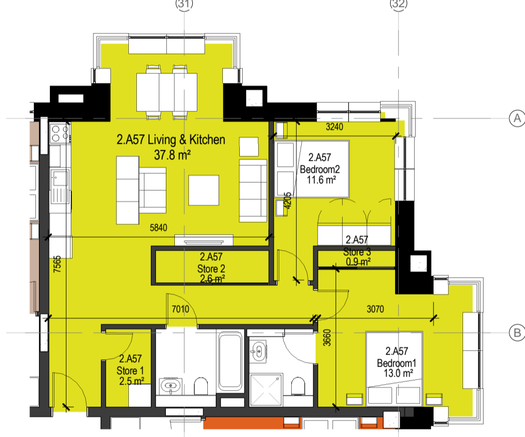
7 2 Bed Type 2.4K 1 : 100