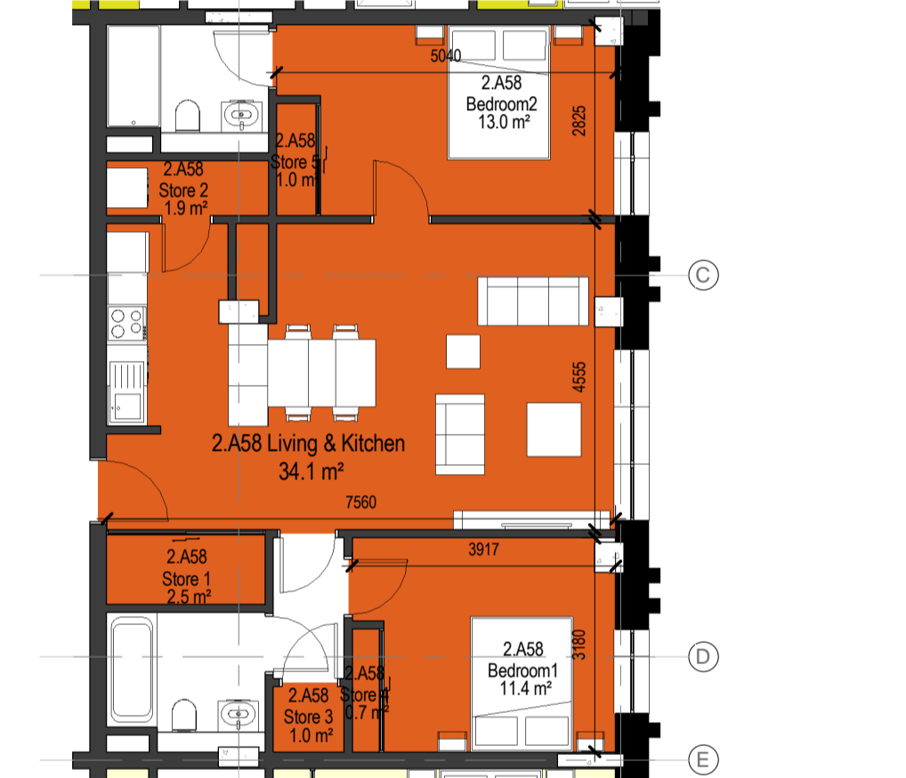
8 2 Bed Type 2.4L 1 : 100