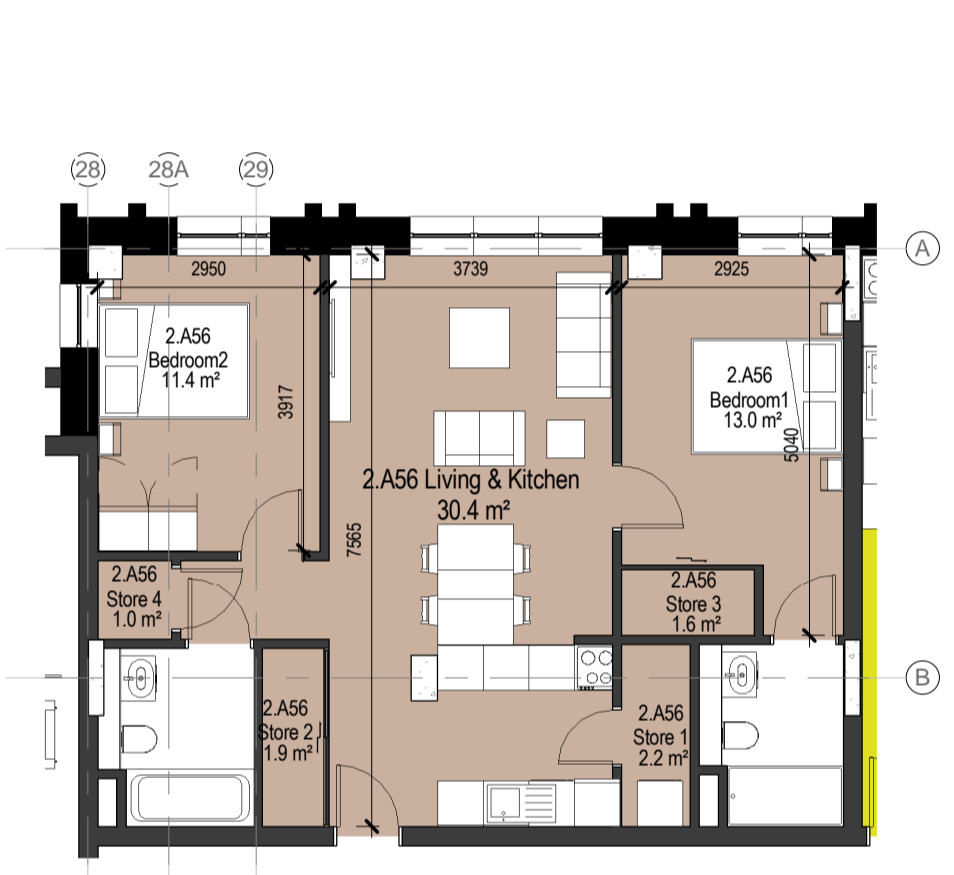
5 2 Bed Type 2.4I 1 : 100